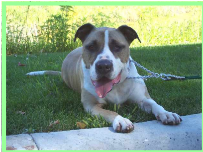
Addante says: "Let's Go!"

Unless we have other weekend events, we dedicate most Sundays to our kennel dogs (the ones who aren't in foster homes).